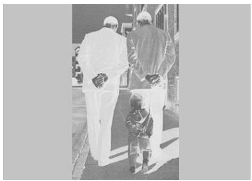
It's a strange world

Update October 2010 Report 04 of the endeavor to develop Autism and Trauma Help in Bosnia and Herzegovina